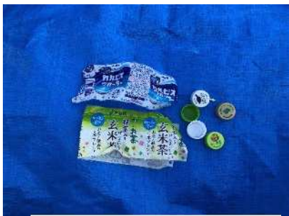
Plastic bottle caps and labels