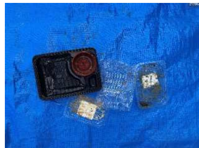
Lunch and side dish containers