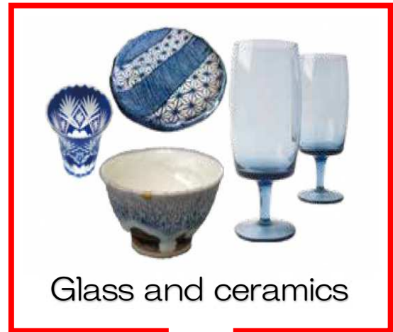
Glass and ceramics